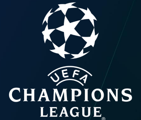
IMPRESSIONS PER MATCH DAY